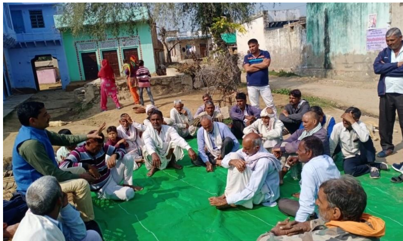
Farmers in India going through agribazaar’s Agri-Entrepreneur Programme, which trains them on how to use the digital platform to market their harvests

https://www.temasek.com.sg/en/news-and-views/stories/future/feeding-the-next-billion/digitalising-the-agriculture-supply-chain